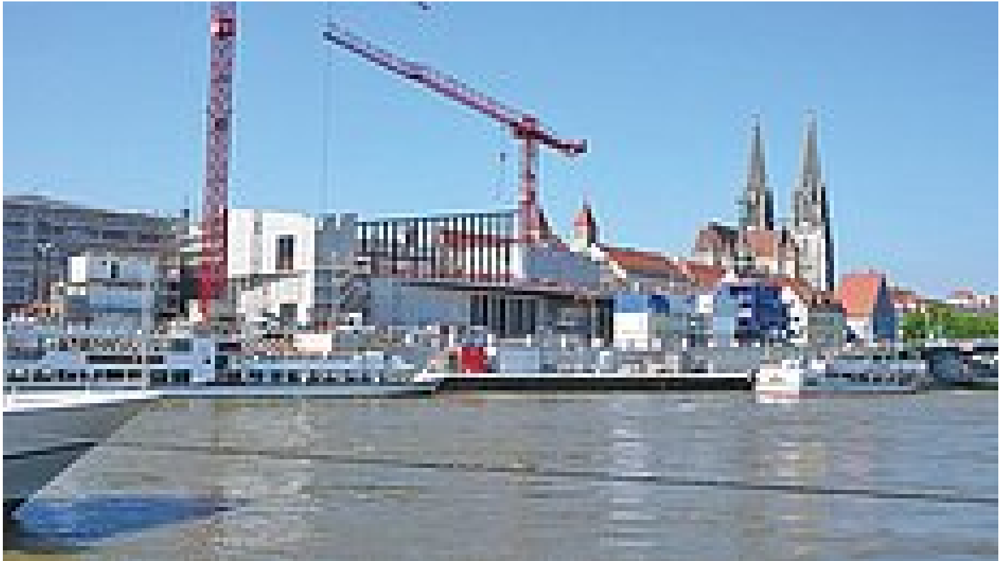
A house of the future for the history of the present in the city of Regensburg

In the city of Regensburg in the Upper Palatinate, an administrative district in the Northeast of Bavaria, the new museum of Bavarian history is currently under construction.