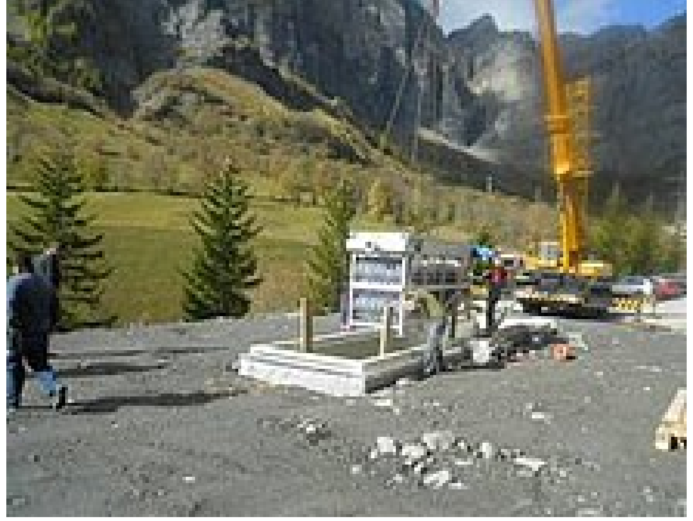
HUBER RoWin Heat Exchanger (tank version) during installation

the parking area on the rear side of the spa. In order not to lose some of the parking area, the tank has load-bearing covers. So, it is out of sight but thanks to its excellent performance certainly never out of mind.