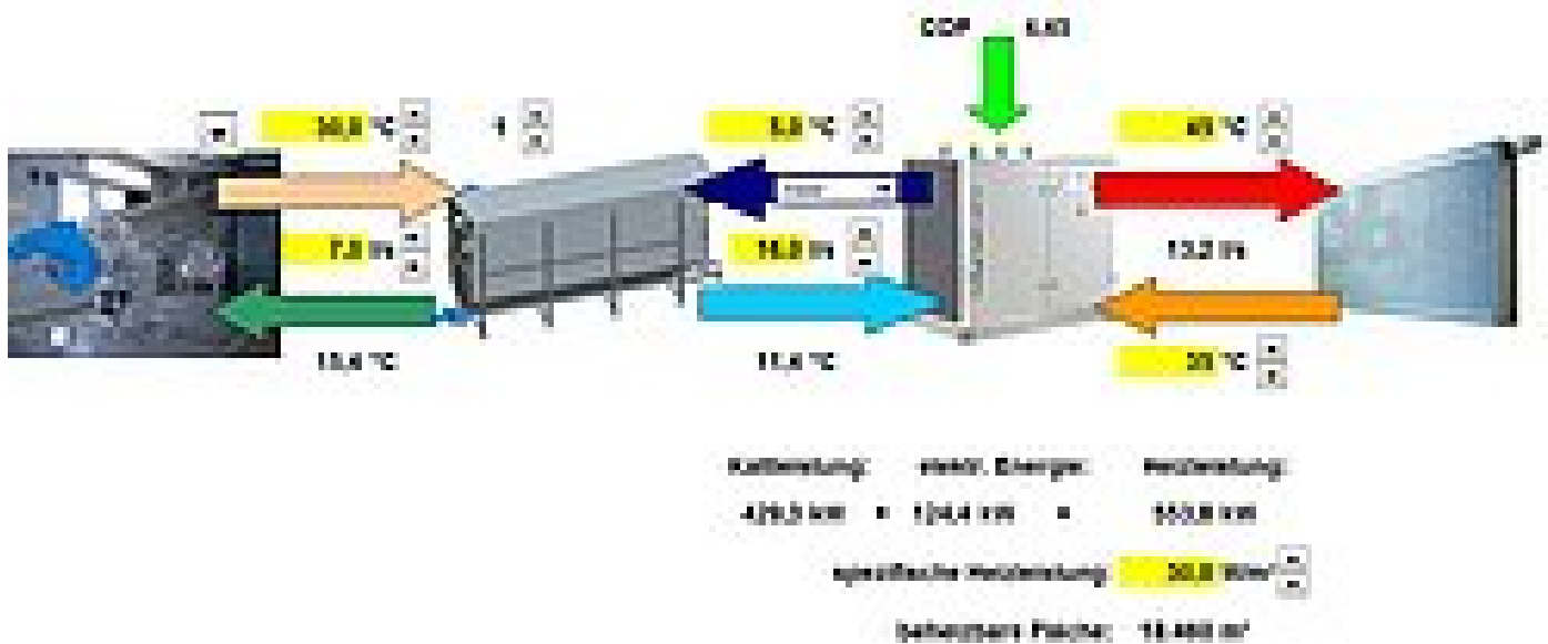
Fig. 1: Example of an application with filtrate water

He describes with few words why it is becoming increasingly important to recover used energy. The below examples of projects that use wastewater and process water heat show how energy recovery can successfully be realised in practice.