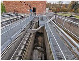
HUBER Storm Screen ROTAMAT® RoK1 TS for defined discharge of screenings