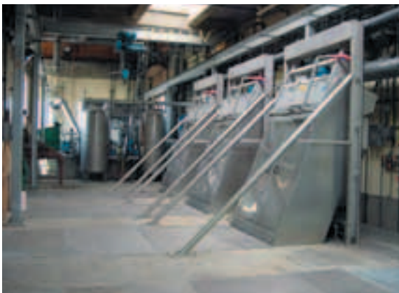
Vacuum Conveyor system in North Davis, UT: Vacuum Buffer Tanks (background) serving several STEP SCREENS® SSV (foreground)