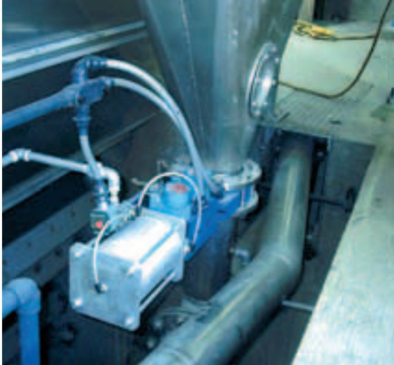
Knife gate at a screenings hopper and second vacuum conveyor line