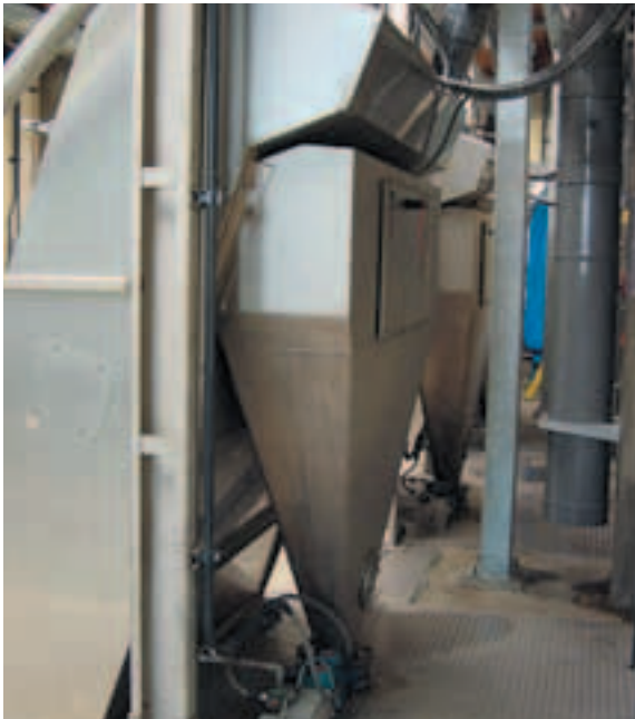
Screenings hopper at a STEP SCREEN® SSV