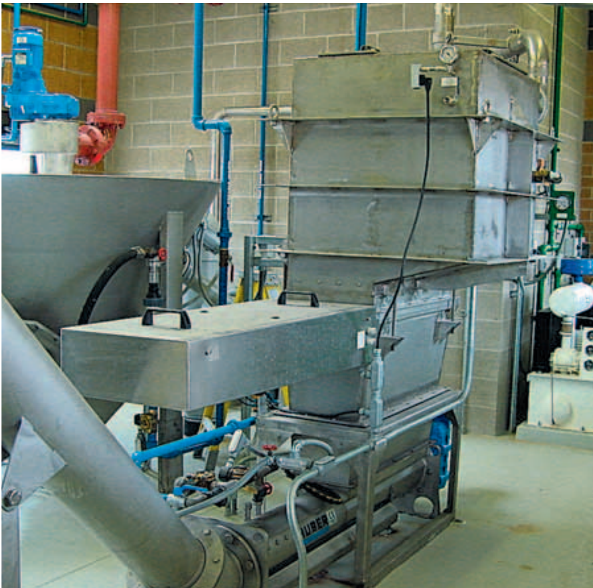
Vacuum Conveyor System in Magna, UT: Reception Unit (center) above a WAP, Vacuum Pumps (background right), and Grit Washer RoSF4 (left)