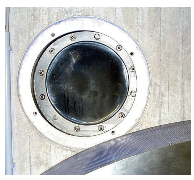
Inspection window type TT8, inside diameter 400 mm