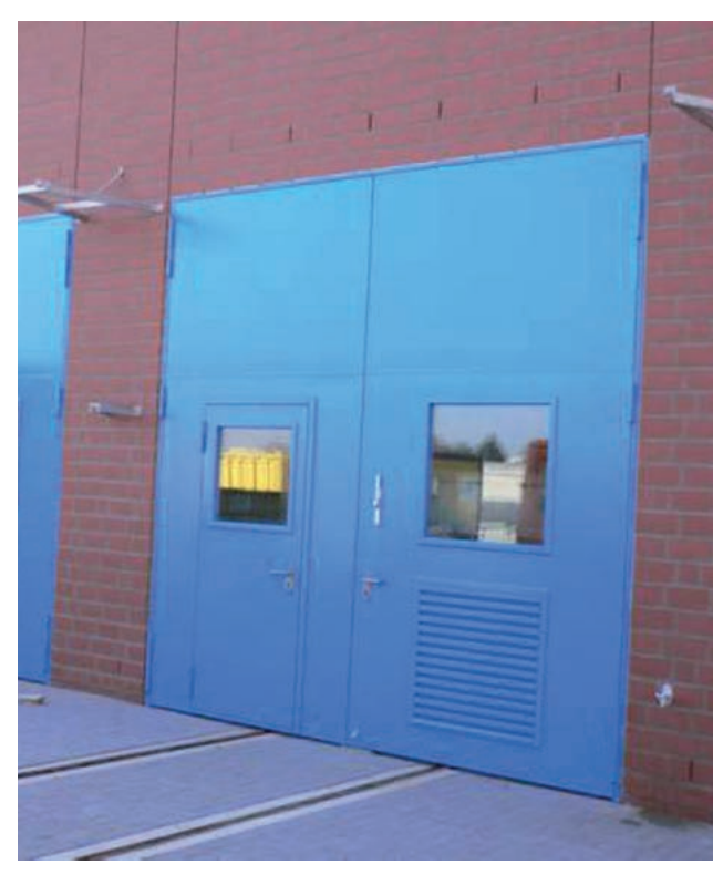
Exterior door type TT1.2, double-leaved, with louvre and wicket door, painted