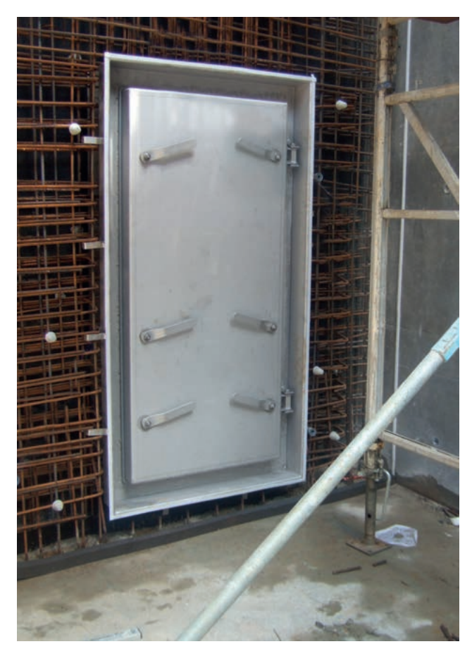
Pressure door type TT7, with locking levers before embedding into concrete