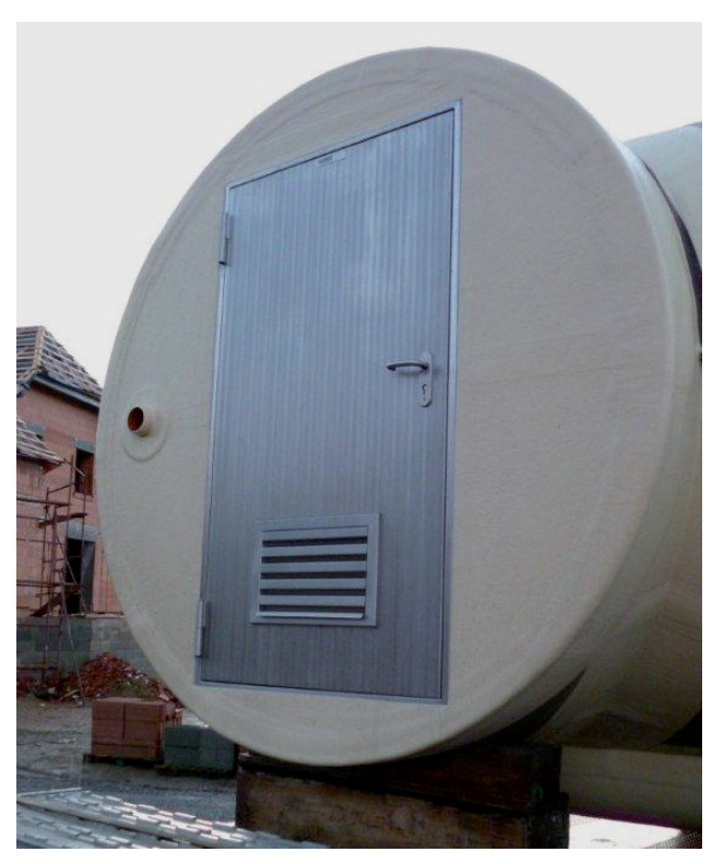
Exterior door type TT1.1, with louvre, installed in a GRP tank