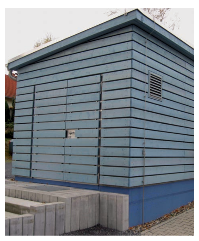
Exterior door type TT1.2, integrated in a wooden facade