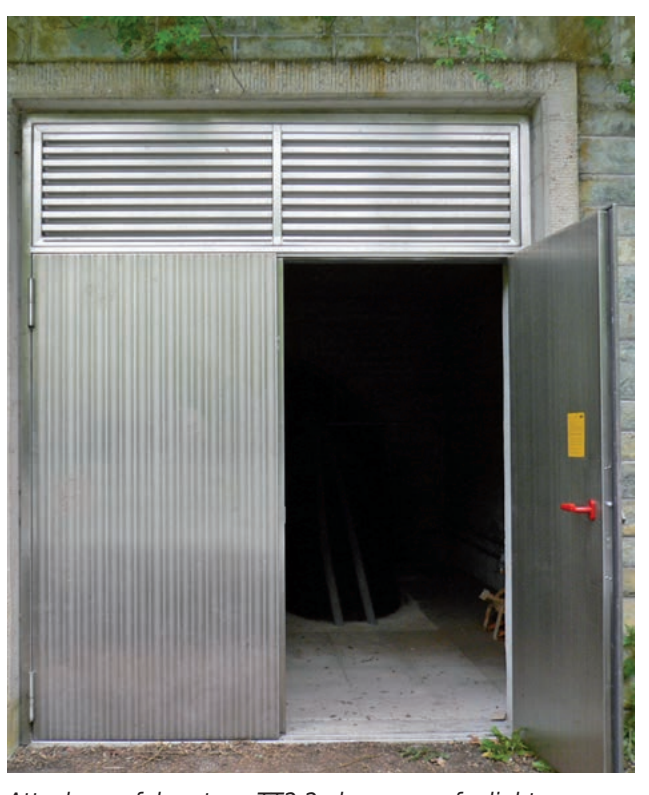
Attack-proof door type TT2.2., louvres as fanlight