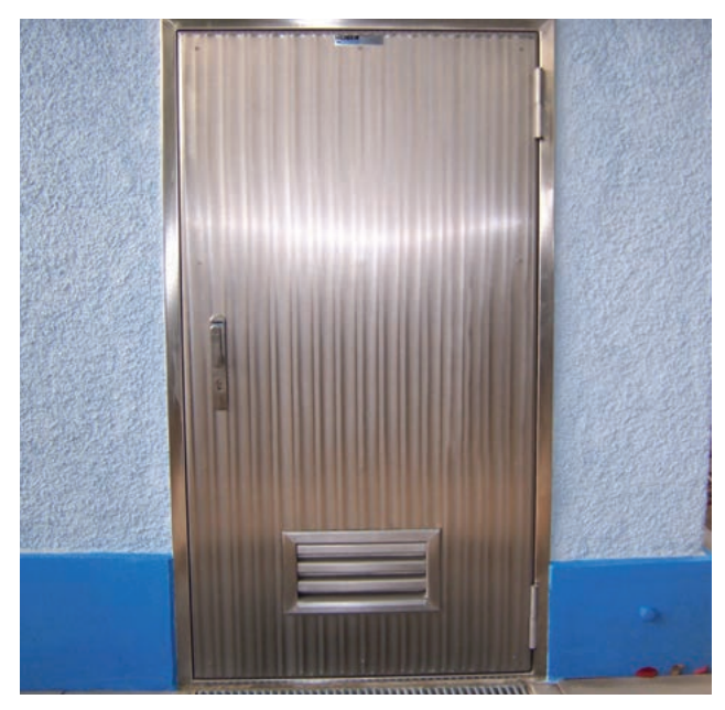
Attack-proof door type TT2.1, with louvre