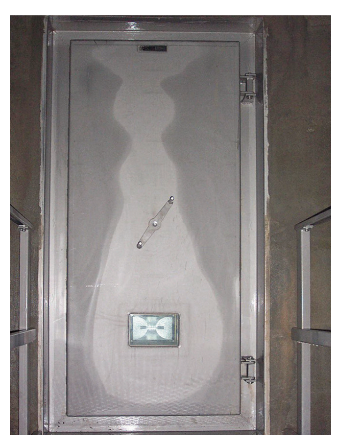
Rectangular pressure-tight door TT 7.Z, with easy to operate central lock with spotlight, view of interior door side