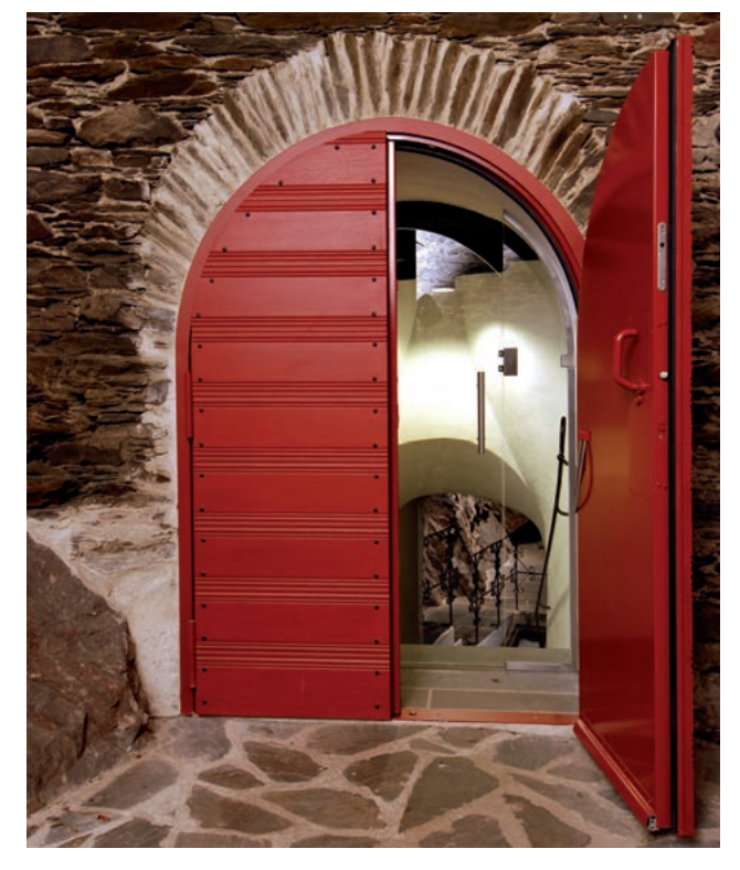
Attack-proof door type TT2.2, arched door with wood panelling, painted