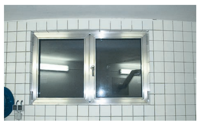
Double tilt window F 3, designed to prevent thermal conduction