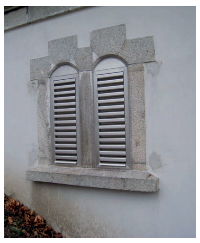
Attack-proof louvres type TT2.J