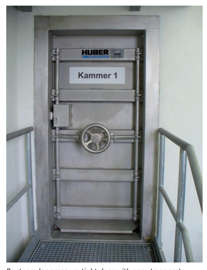
Rectangular pressure-tight door with easy to operate central lock TT 7.Z