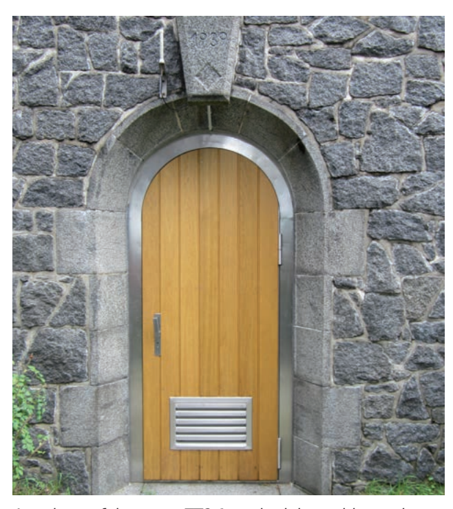
Attack-proof door type TT2.1, arched door with wood panelling