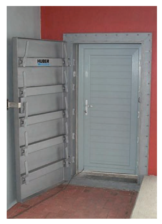
Pressure door type TT7 with locking levers as flood protection door