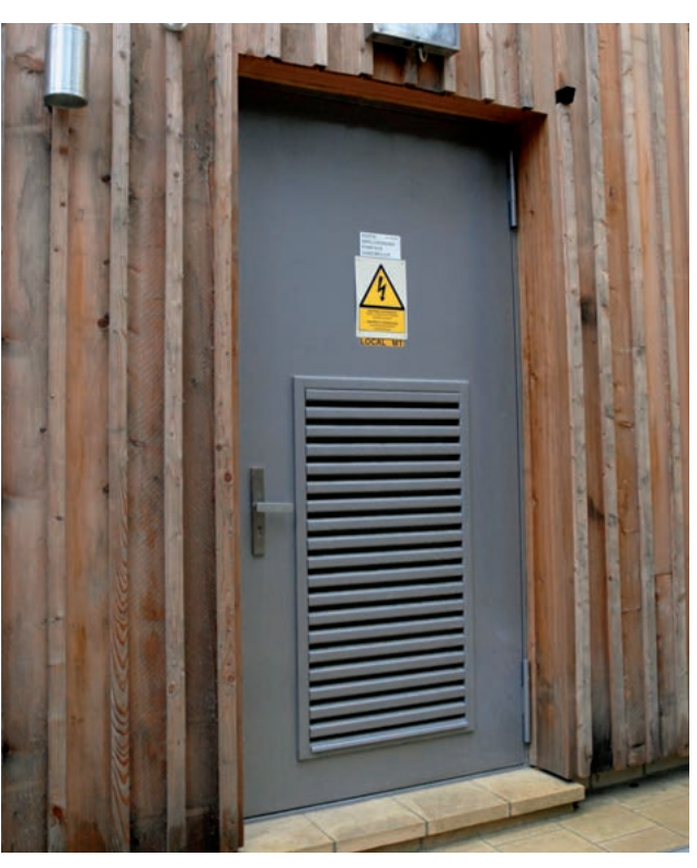
Exterior door type TT1.1, with louvre, painted