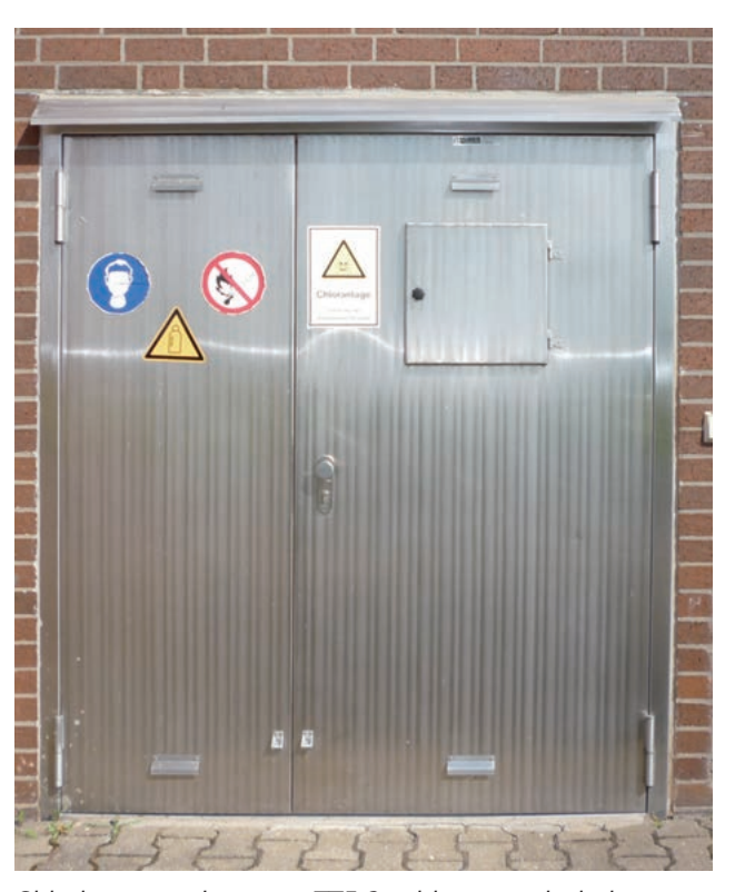
Chlorine room door type TT5.2, with covered window