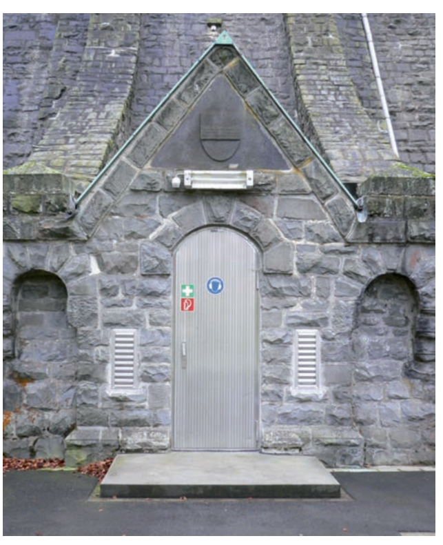
Attack-proof door type TT2.1, arch door, rigid louvres type TT10