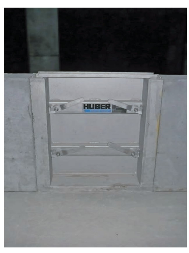
Pressure door type TT7, with locking levers, open top, for parapets