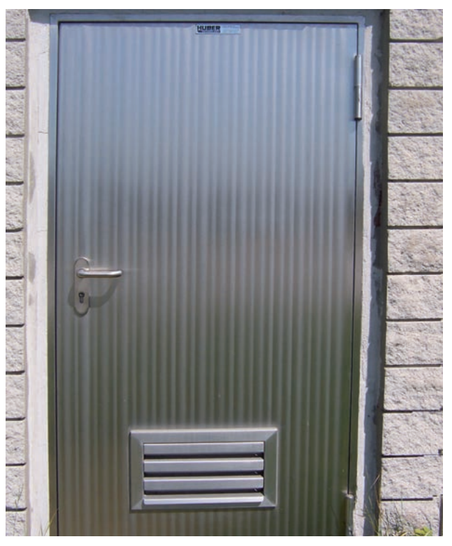
Exterior door type TT1.1, with louvre