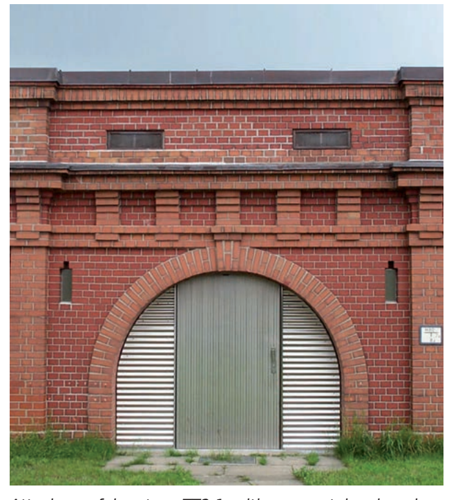
Attack-proof door type TT2.1, with segmental arch and side infills