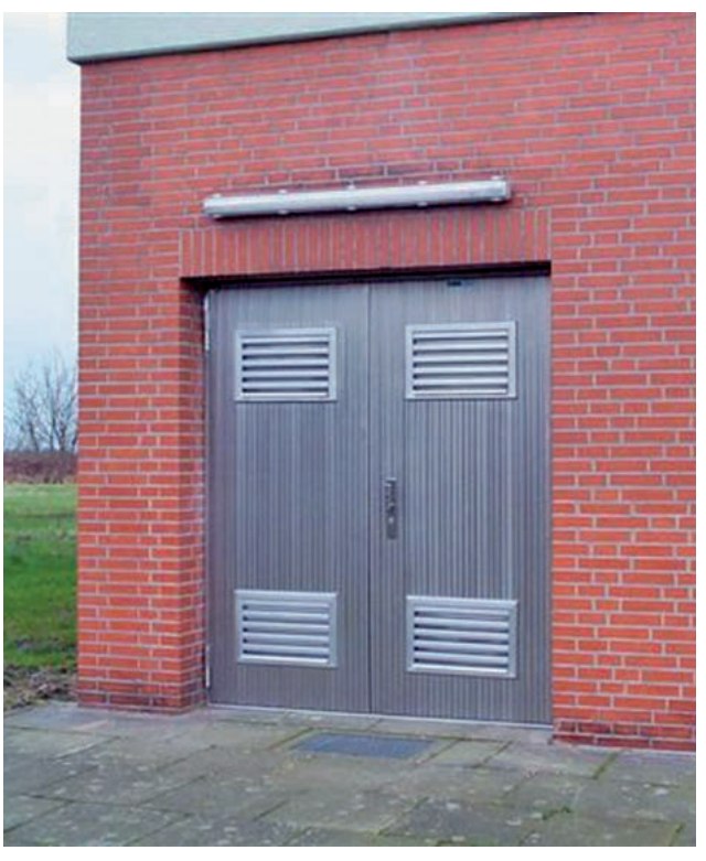
Attack-proof door type TT2.2, with two louvres in each door leaf