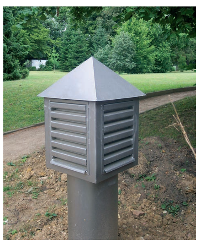
Exhaust stack with rigid louvres type TT10