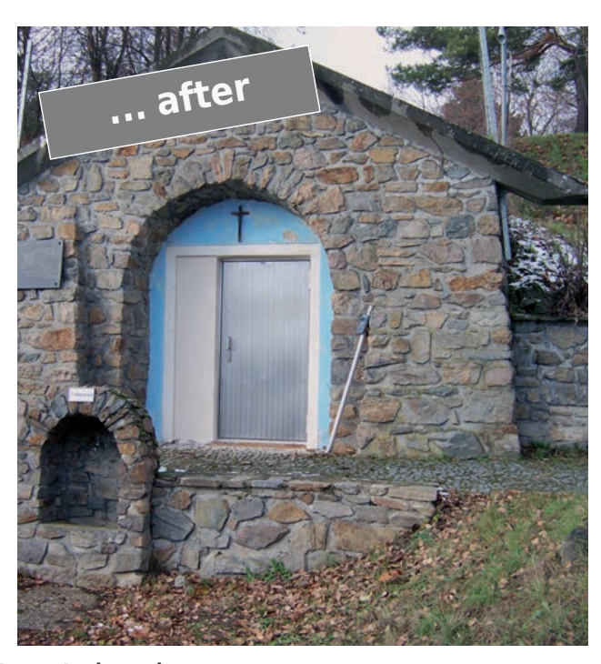
>>> We have the suitable solution. Don't hesitate to contact us.