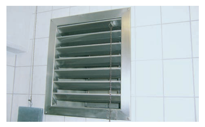
Adjustable louvre for interior side TT 10