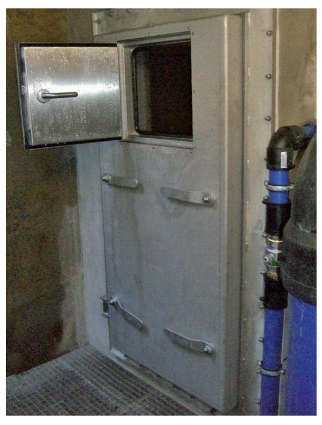
Pressure door type TT7, with locking levers and integrated inspection opening