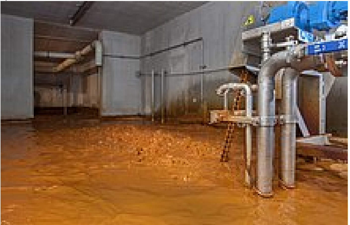
Fig. 4: MBR plant with a HUBER Membrane Filtration VRM® 30/18 RF in one filtration chamber