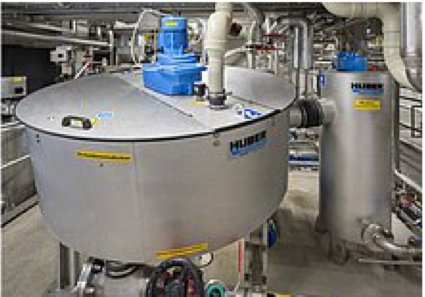
Fig. 5: Thickening of flotante and excess sludge with a HUBER Disc Thickener S-DISC

can completely be treated on the company site while the production wastewaters are still passed on to the municipal sewage plant that needs these volumes to work efficiently. In case of necessity, the total wastewater can be introduced into the sewer network.