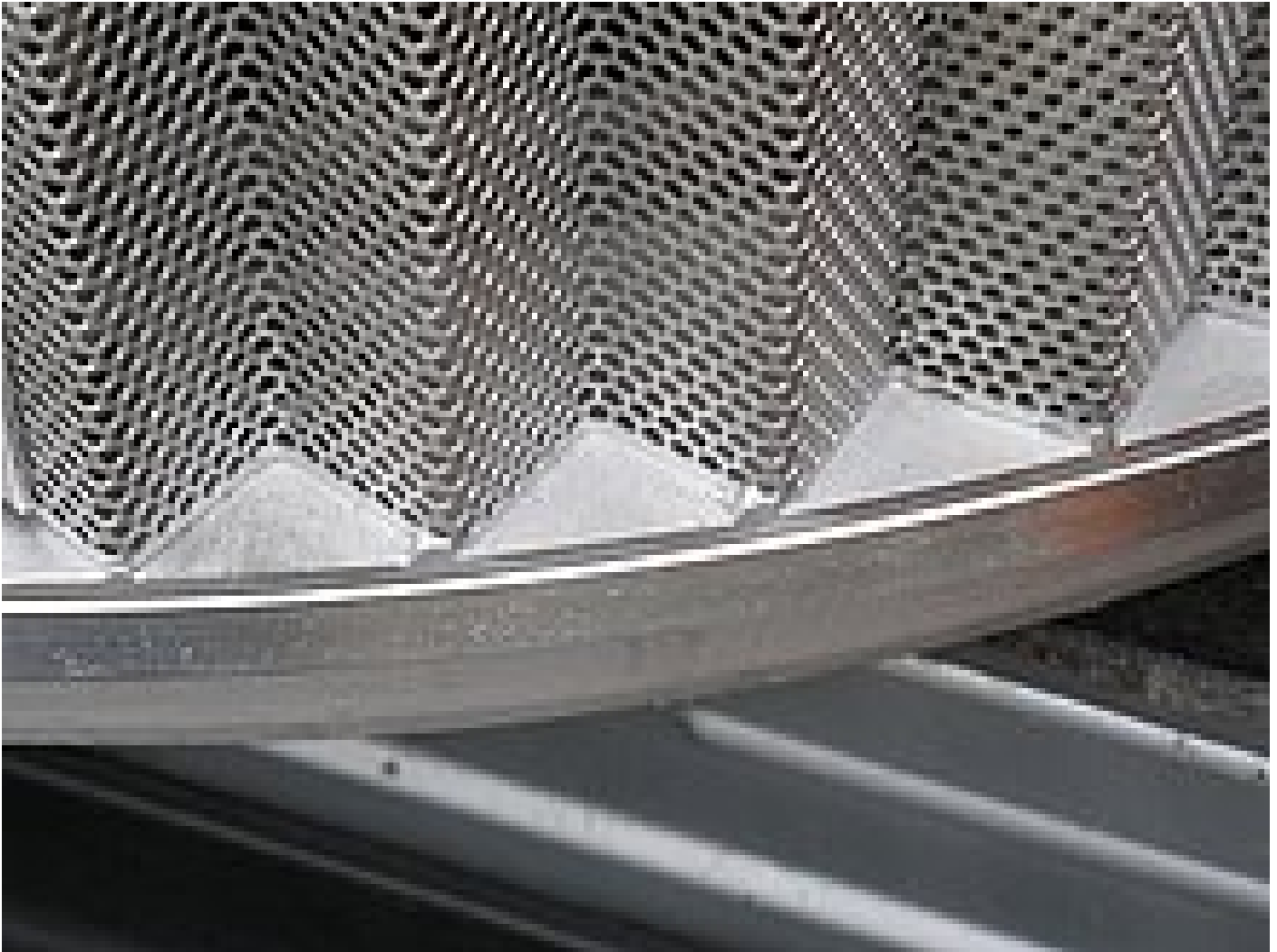
Star-shaped screen drum of the ROTAMAT® Perforated Plate Screen RPPS-Star

On the basis of the worldwide known and well-proven system of HUBER ROTAMAT® fine screens with wedge wire screen basket we developed the ultra-fine ROTAMAT® Perforated Plate Screen RPPS with perforated plate. The two-dimensional screen (perforated plate) ensures the reliable removal of hairs and fibres and avoids that: