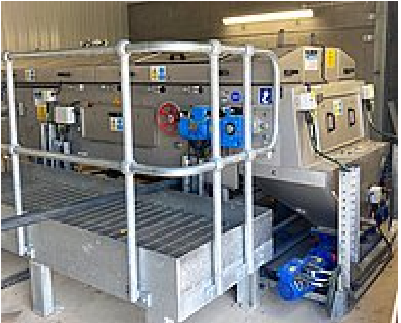
HUBER Belt Thickener DrainBelt - Sludge Thickener