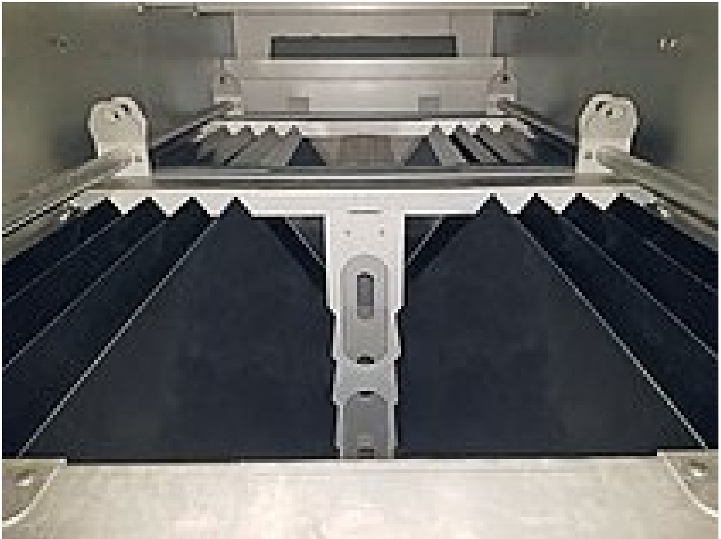
Grit trap with integrated lamella separator