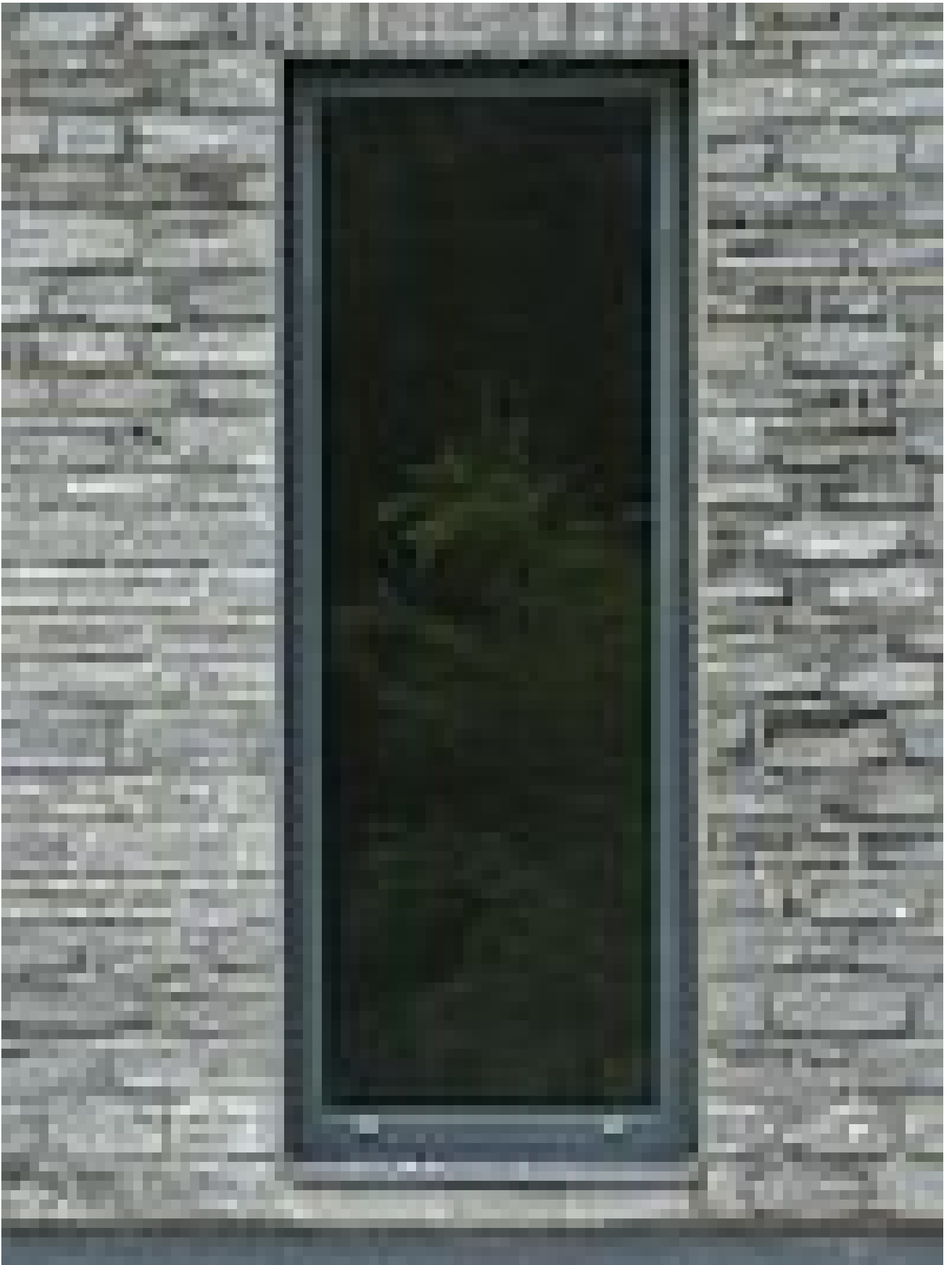
Window with thermo glass and hinged frame F2