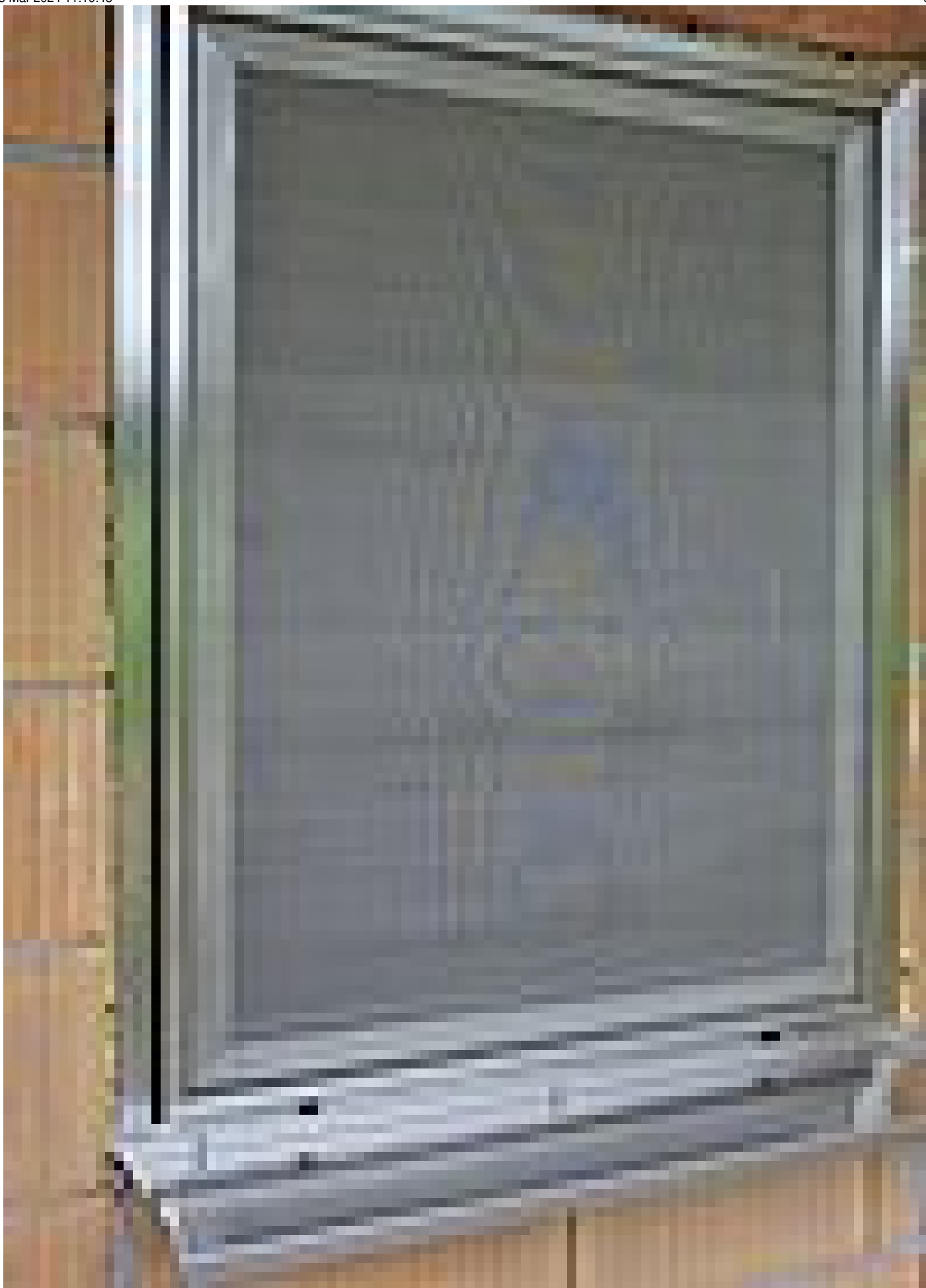
Frame window, rigid, ready for installation, made from two-sheet special 1.4301 (AISI 304) stainless steel profile with intermediate special plastic core to prevent thermal conduction, thermally insulated according to DIN 4108, U_f = 2.70 \text{ W}/(\text{m}^2 \cdot \text{K}) .