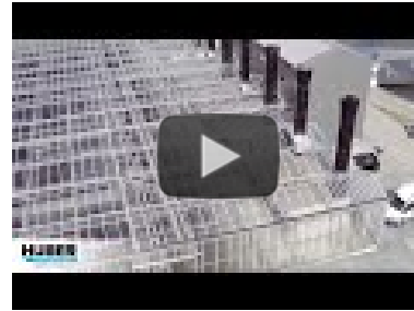
Video: HUBER Sludge Turner SOLSTICE® https://www.youtube.com/watch?v=QdWhhrCOkug