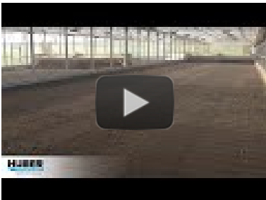
Video: Solar Active Dryer SRT at STP Gunstett https://www.youtube.com/watch?v=JqflpsD16VM