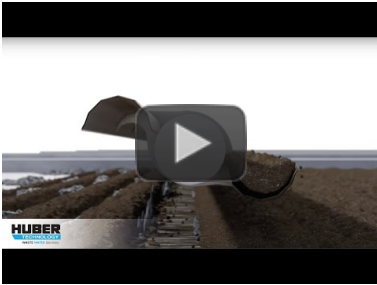
Animation: HUBER Sludge Turner SOLSTICE® for large quantities of sludge https://www.youtube.com/watch?v=T-FUbjSzMZE